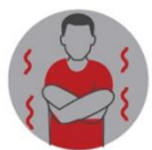
CHILLS AND/OR REPEATED SHAKING WITH CHILLS