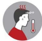
FEVER OF 100°F OR HIGHER